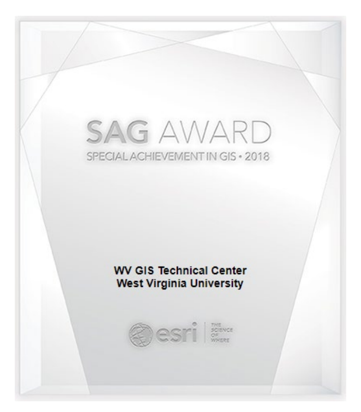
Figure 5. In July 2018 the Center received a Special Achievement in GIS (SAG) Award for its innovative web map applications