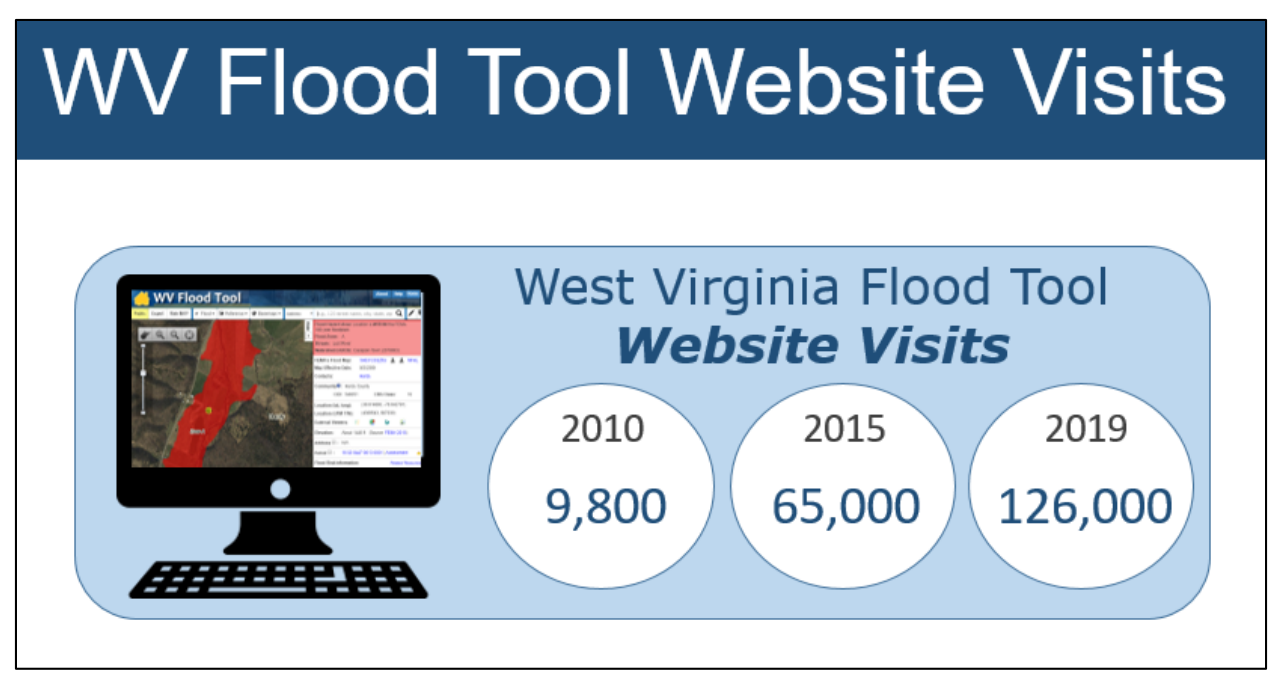
Figure 3. WV Flood Tool (<u>www.mapwv.gov/Flood</u>) web traffic growth since 2010