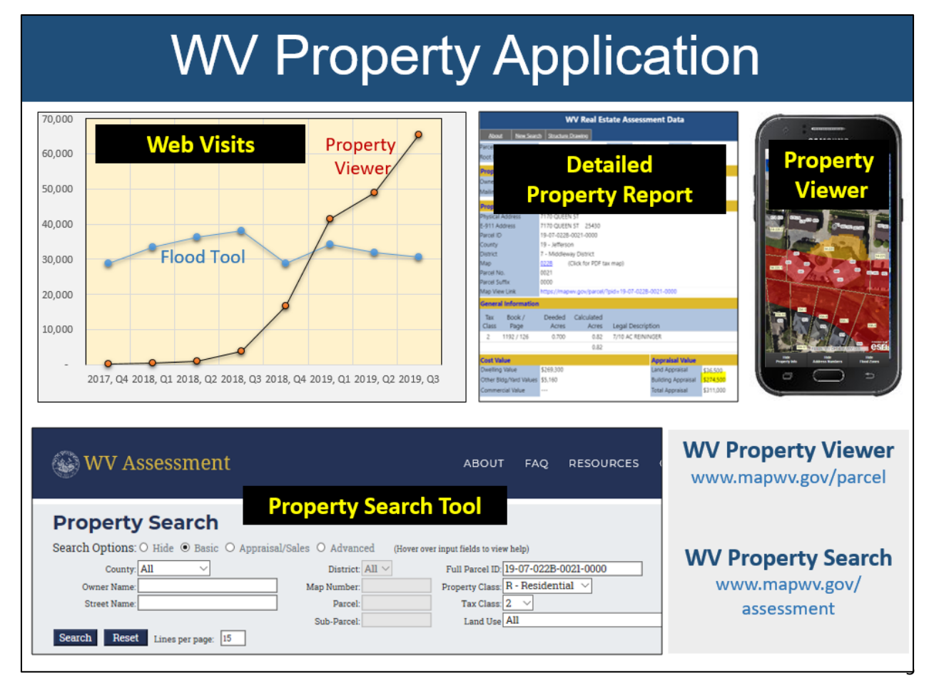
Figure 4. The popular WV Property Application allows for searching and locating property records (<u>www.mapwv.gov/assessment</u>)