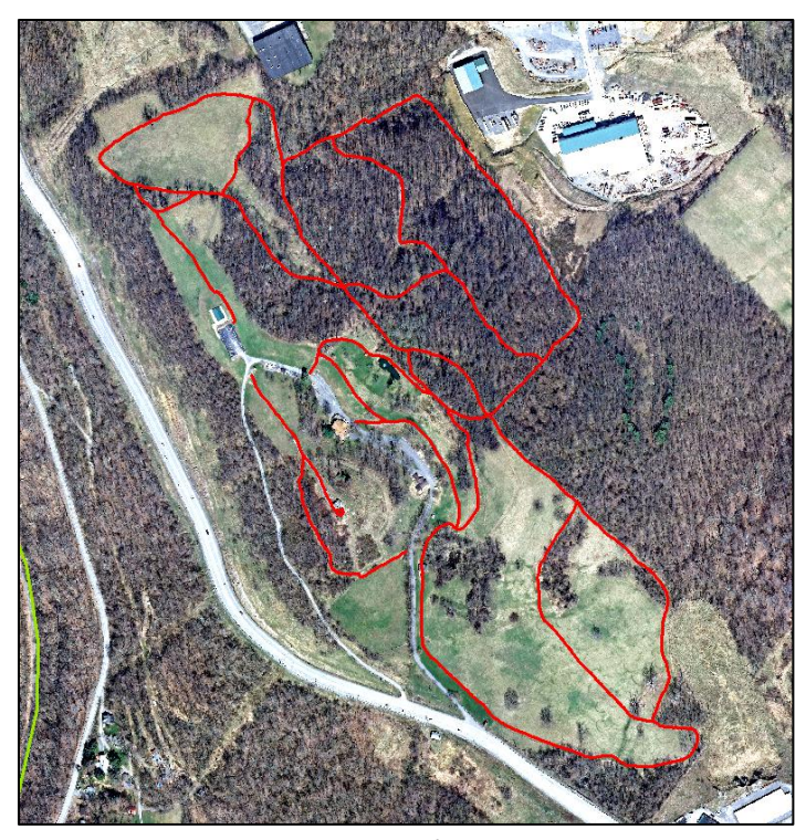
Figure 2. Dorsey's Knob Park

Thirty two (32) new miles of trails were integrated into the statewide database and geometry was dramatically improved for 361 miles of trails. In total, nearly 400 miles of data over 13 counties was updated as part of this project.